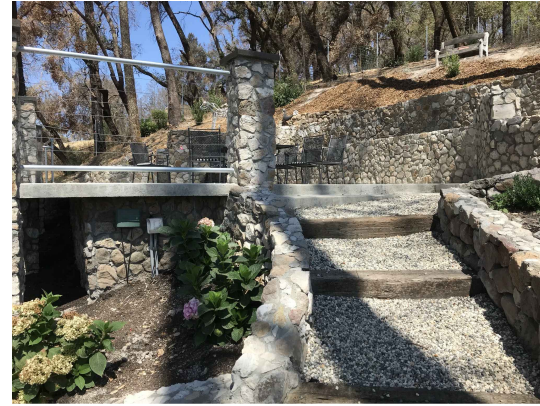
OUTDOOR PRIVATE ENTERTAINMENT AREA 25' X 25' = +/-625' SQ.FT.